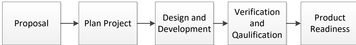
Figure 2 – Product Realization Process